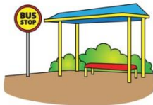
The bus stop