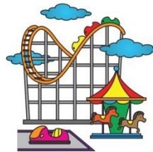
The amusement park