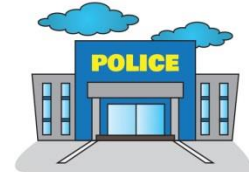
The police station