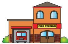
The fire station