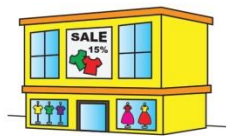
The department store