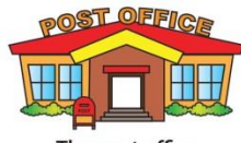
The post office