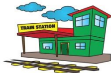
The train station